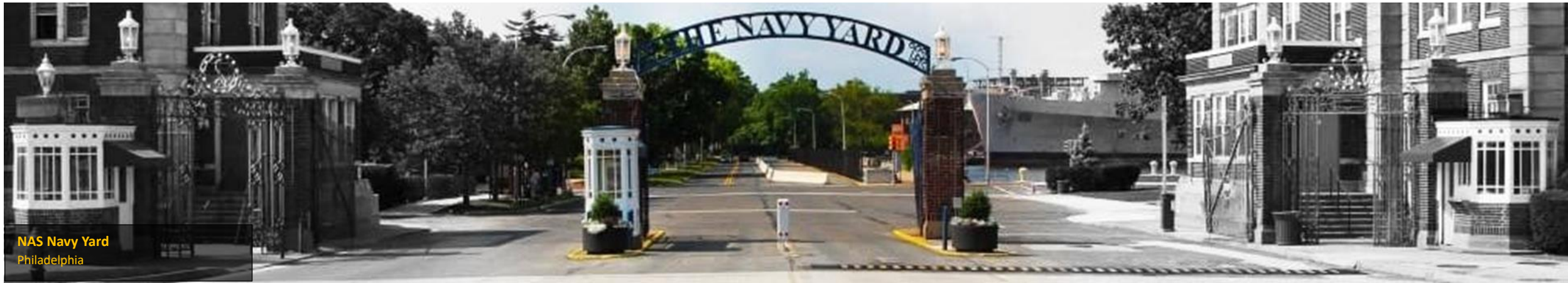
NAS Navy Yard Philadelphia